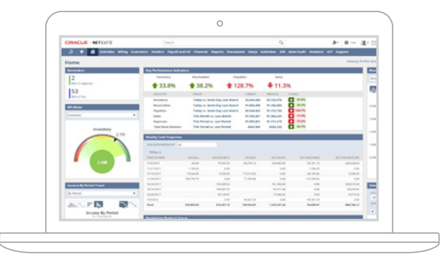
Keep a Pulse on Finances with the Controller Dashboard

NetSuite's cloud-based single platform architecture ensures complete real-time visibility into the financial performance of the business from a consolidated level down to the individual transactions. It seamlessly integrates with all NetSuite order management, inventory, CRM and ecommerce functions to streamline critical processes and deliver the best outcomes for your business.